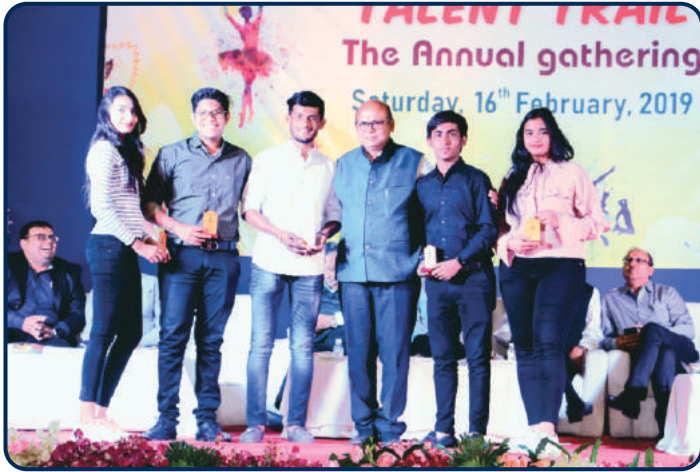
Felicitation of Winner Team of Inter College Management Masters Competition