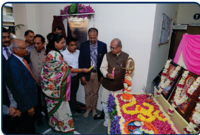
Candle Lighting by Honorable Guests