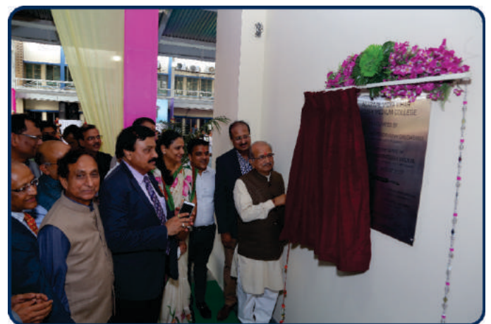
Inauguration of Building by (Honorable Education Minister Shri Bhupendrasinh Chudasama)