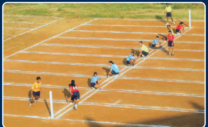
Kho - Kho Ground