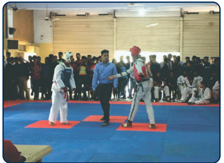
Inter College Taekwondo Match