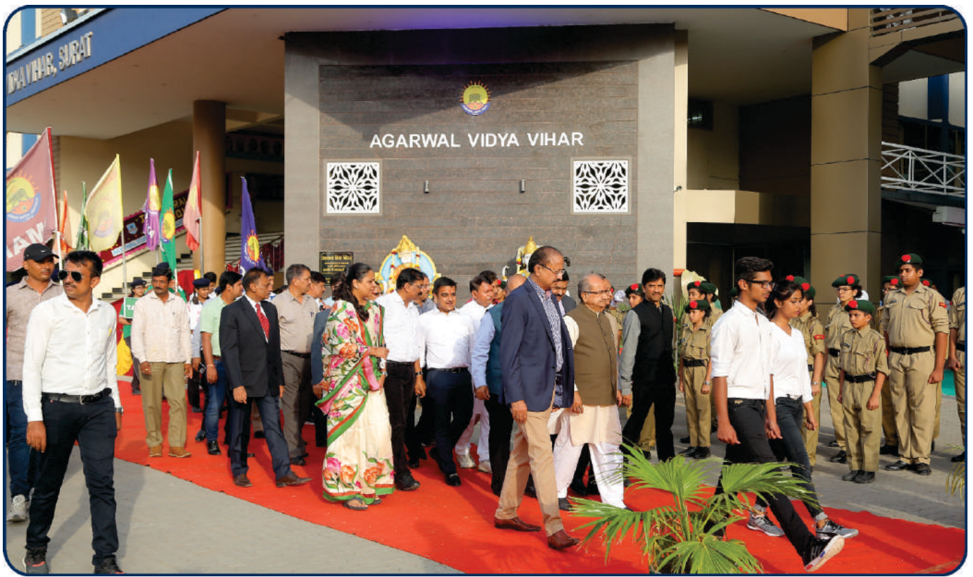
Arrival of Chief Guest (Honorable Education Minister Shri Bhupendrasinh Chudasama)