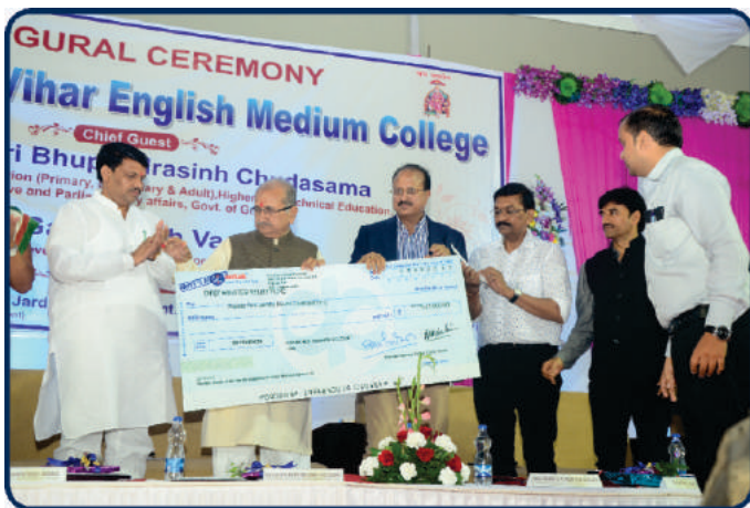
Donation by Agarwal Samaj Vidya Vihar Trust in Chief Minister Relief Fund