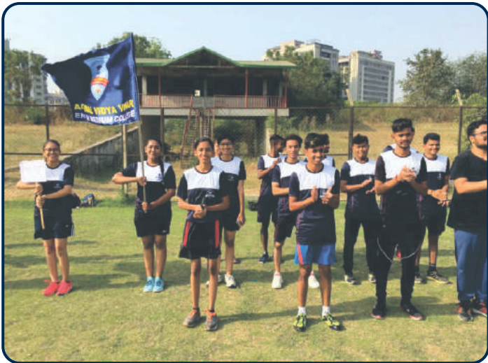
Inter College Athletic Meet