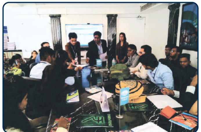
Bombay Stock Exchange, Mumbai