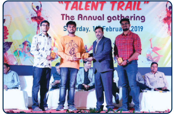
Felicitation of Winner Team of Inter College Quiz Competition