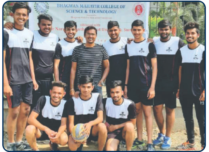
Inter College Volley Ball Competition