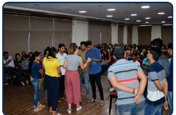
AIESEC Guest Lecture by student's from Turkey & Spain