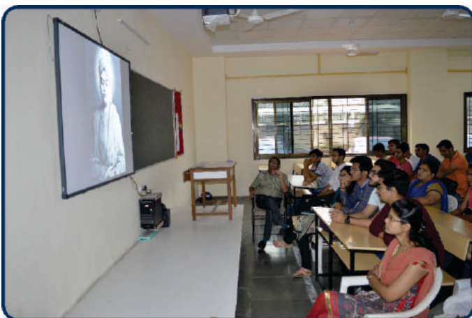
Swami Vivekananda Birthday (National Youth Day)