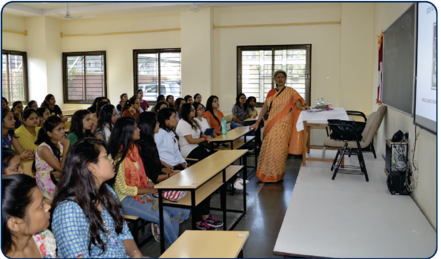
Guest Lecture on Breast Feeding