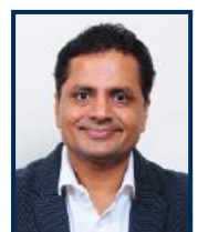
SHRI SUBHASH BANSAL SPECIAL INVITEE