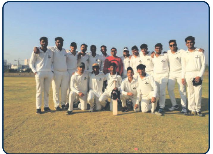
Inter College Cricket Team