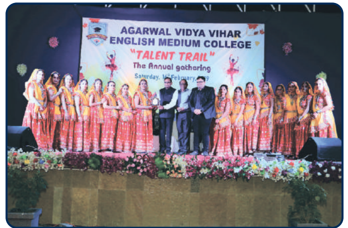
Felicitation of V.N.S.G.U Youth Festival Garba Competition Second Prize Winner Team