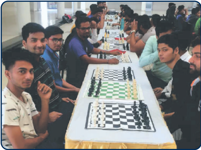
Inter College Chess Competition