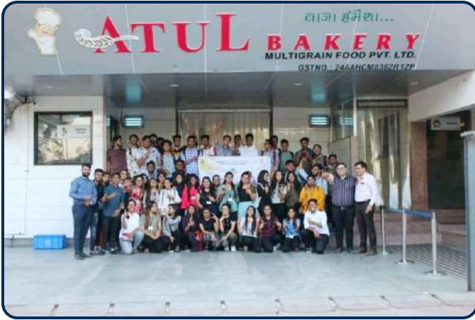
Atul Bakery, Surat