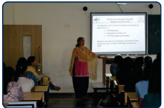
Guest Lecture on Sustainable Development