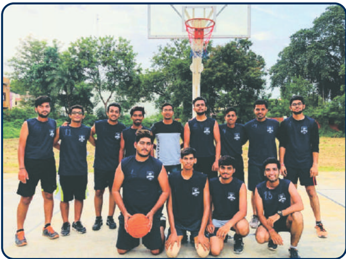
Inter College Basketball Team